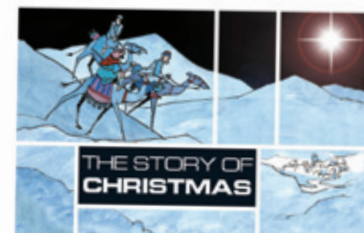
As told in the gospels of Matthew and Luke

We now have another 20,000 copies of 'The Story of Christmas' and it would be really good if they could all be distributed by the 25 th December.